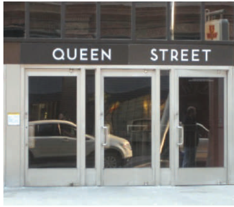
Entrance to Queen Street?

The DYBIA considers the omission of the downtown stations a grave oversight. They are four (King, Queen, Dundas and College) of the most heavily used stations in the system and are the stations most often used by tourists and visitors to Toronto. Not only that, but the design concepts accepted by the TTC for further review are expensive, unnecessary and widely inappropriate for downtown stations.