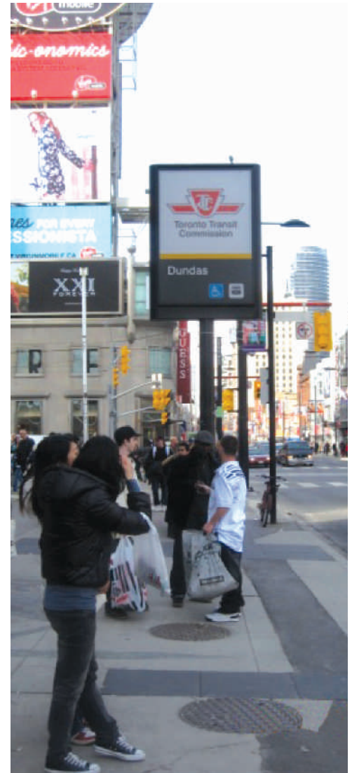
Dundas “what”? Which way?