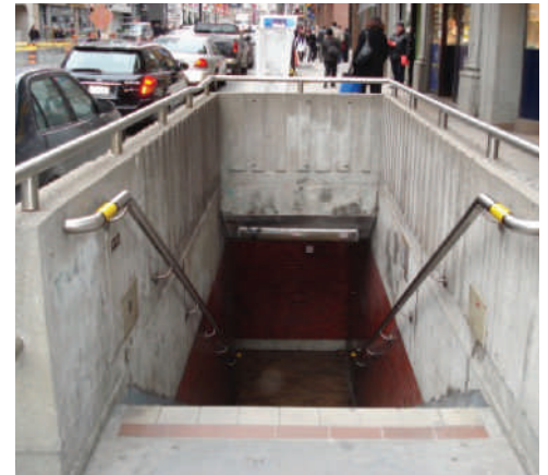
Exposed stairwell, Yonge & Shuter