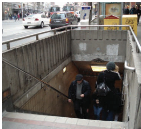
College entrance, northeast corner, Yonge & Carlton

The exposed stairwells at Yonge and Shuter, College and Yonge and Yonge and Dundas are in a tragic state of disrepair raising safety concerns and comfort concerns; concrete is crumbling, railings are bent and all are open to the elements, rain or shine.