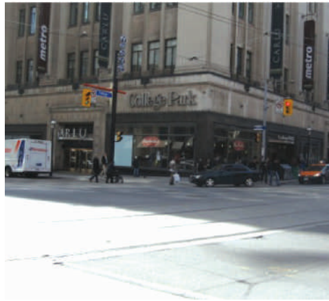
No “sign” of a subway entrance anywhere on the south west corner of Yonge & College.