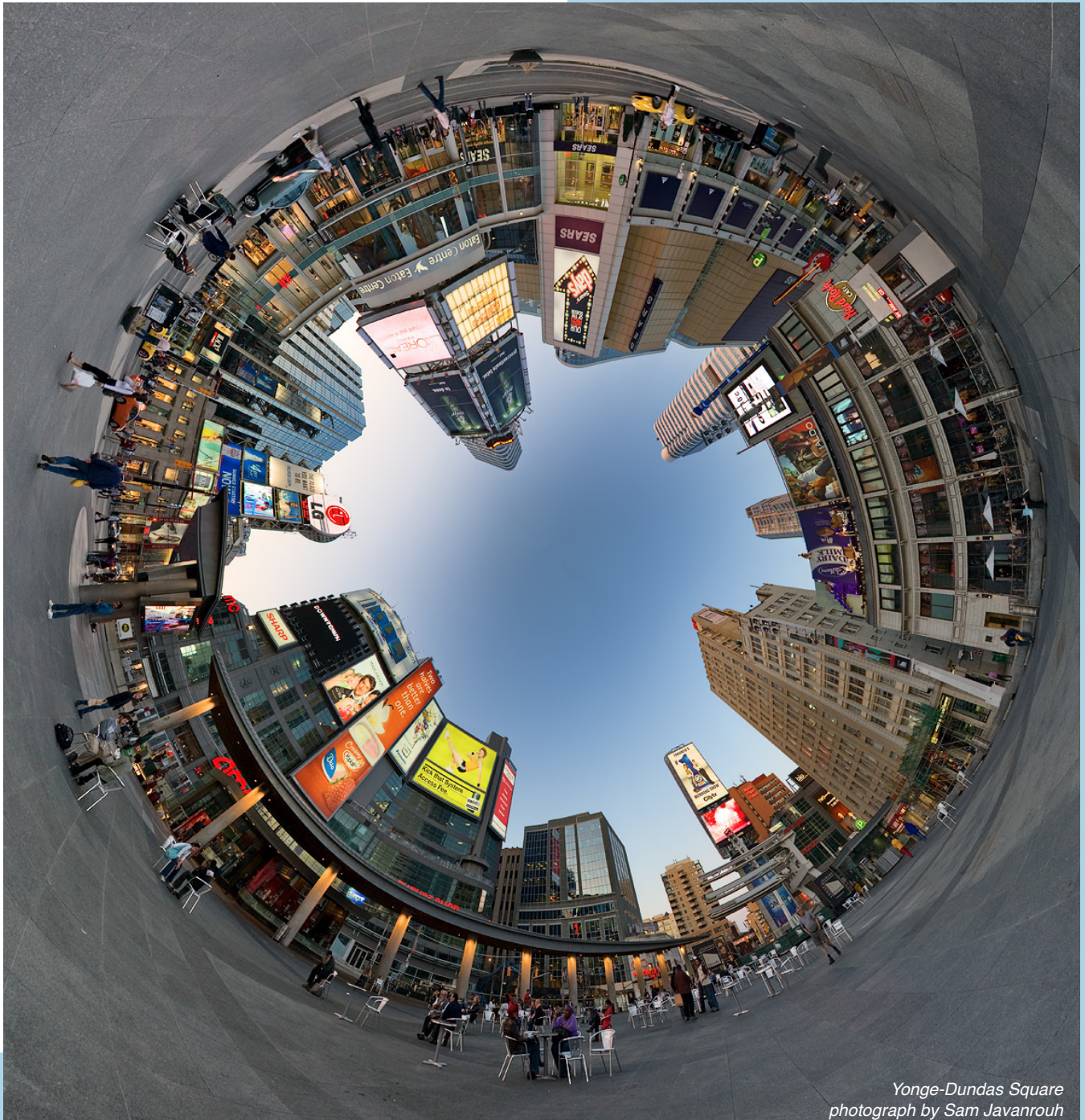
Yonge-Dundas Square

For more information or to obtain a copy of the Bright Lights – Big City: A Signage Vision for the Downtown 'Yonge Strip', please contact: